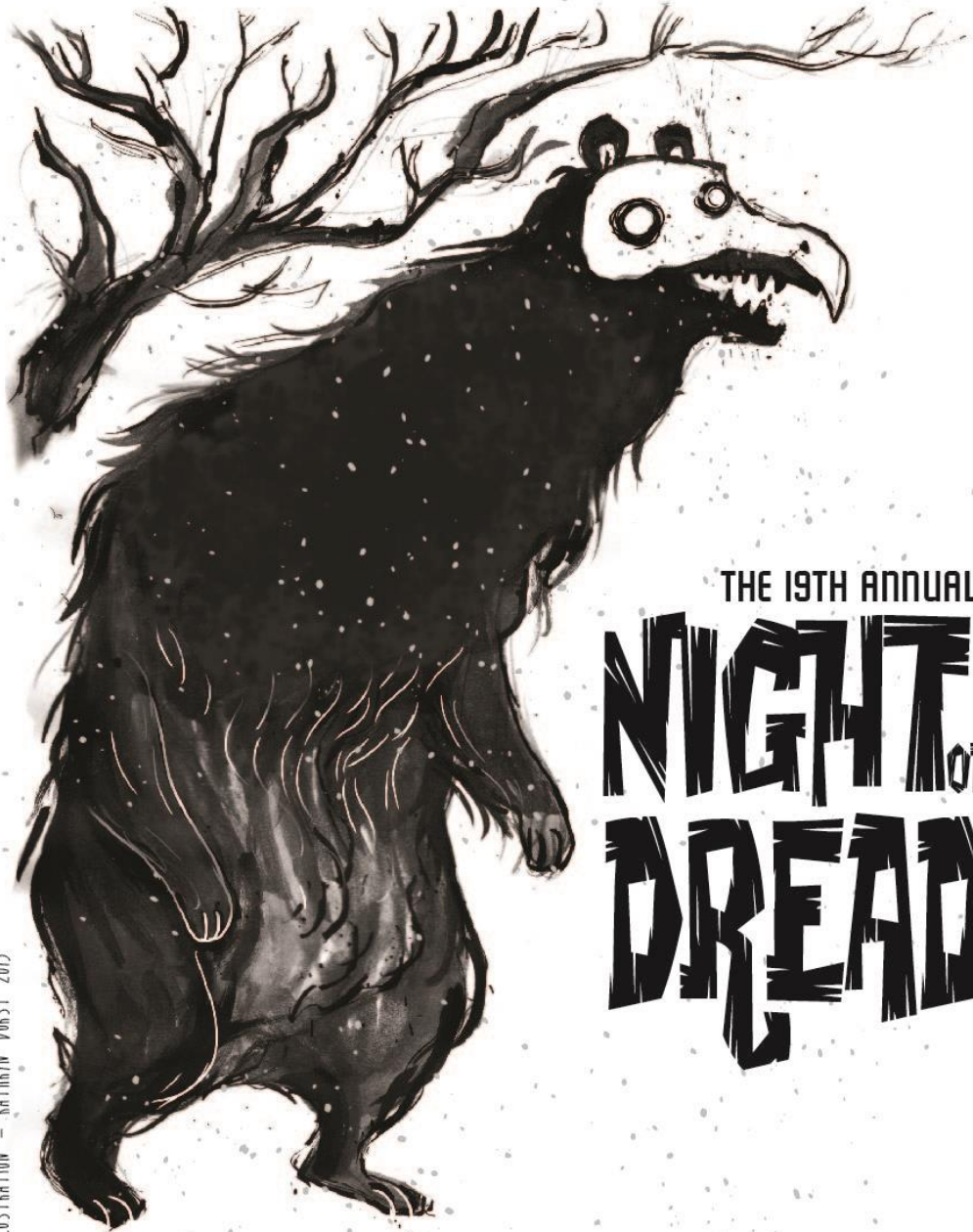
ILLUSTRATION - KATHRYN PURST 2015